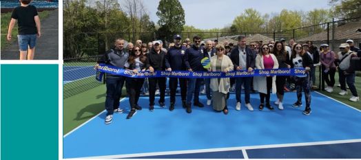
NEW PLAYGROUND & PICKLEBALL COURTS

PROPERTY CRIMES DOWN 80% SCAN QR CODE to learn more about the work of MAYOR HORNİK and CHIEF PEZZULLO for Marlboro Township SAFETY INITIATIVES