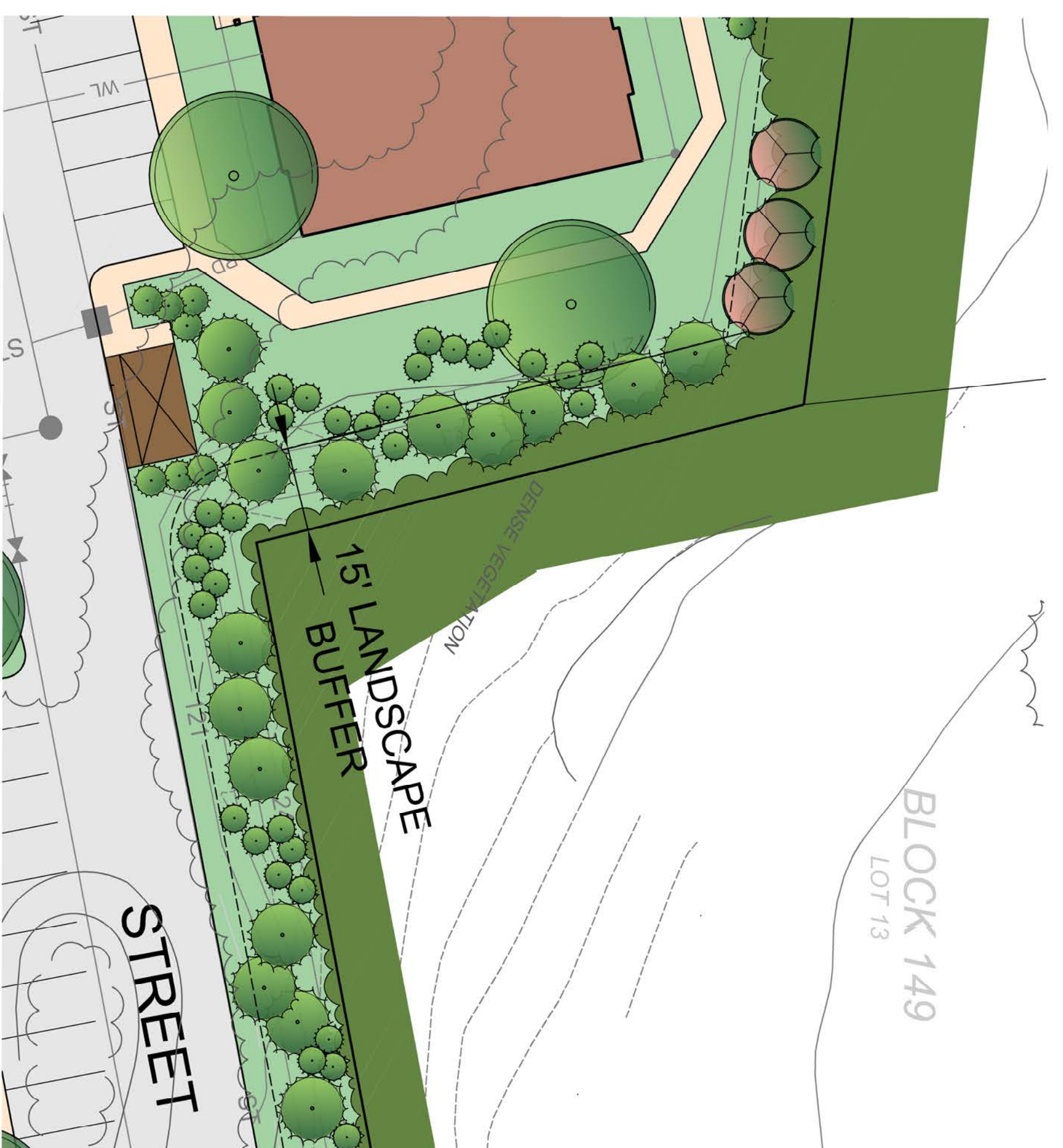
LANDSCAPE BUFFER DETAIL B SCALE: 1" = 20'