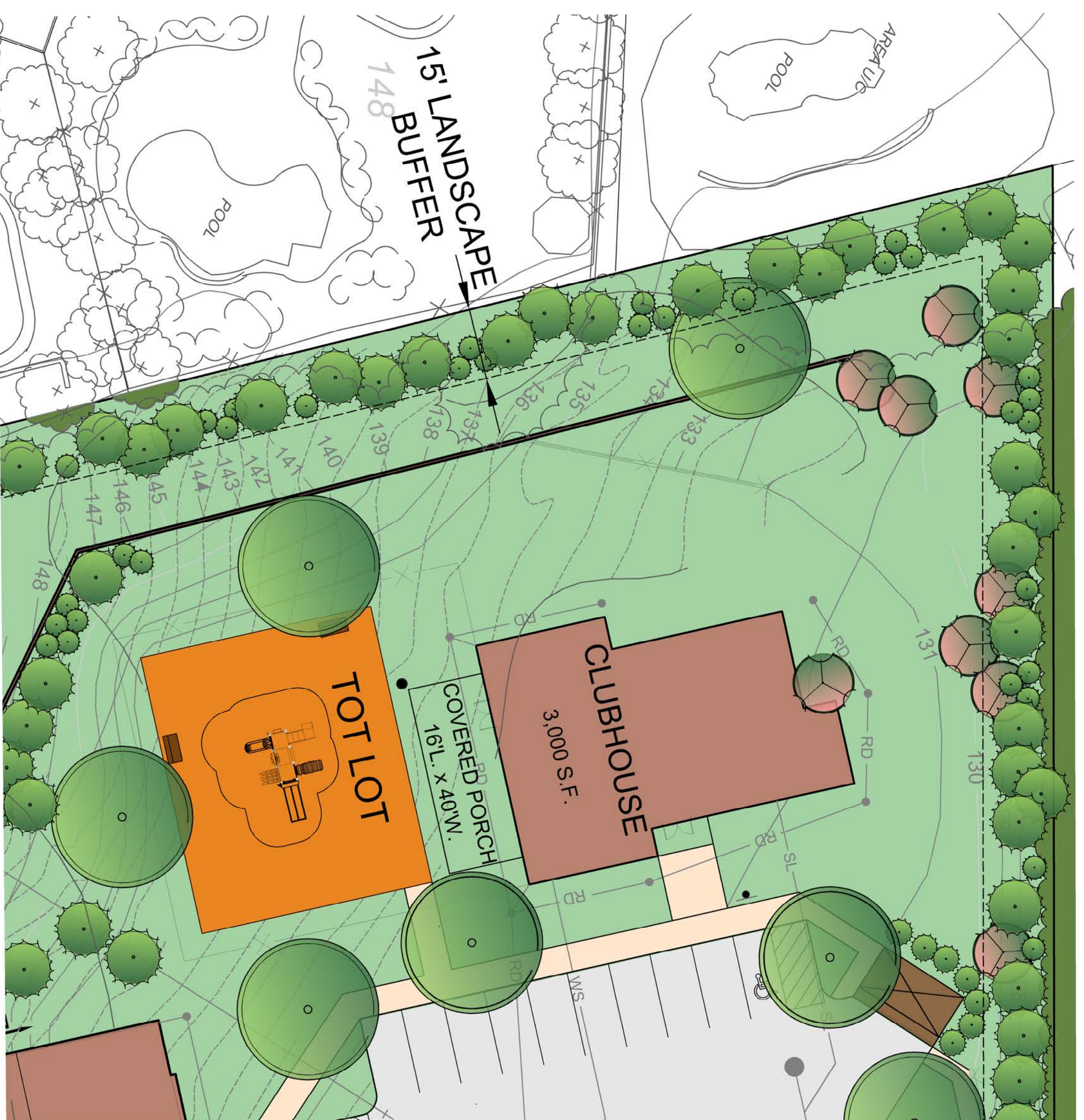
LANDSCAPE BUFFER DETAIL A SCALE: 1" = 20'