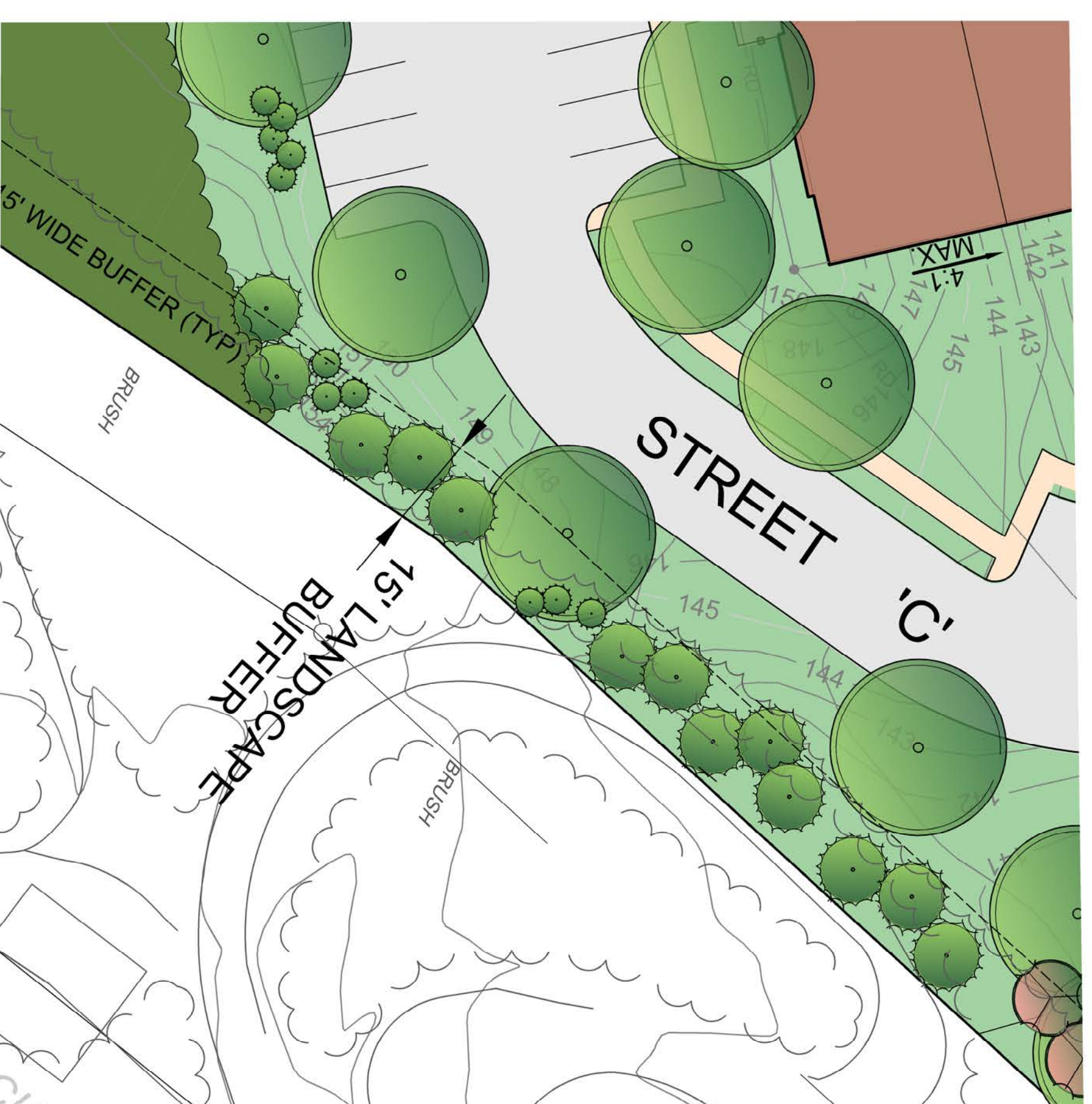
LANDSCAPE BUFFER DETAIL C SCALE: 1" = 20'