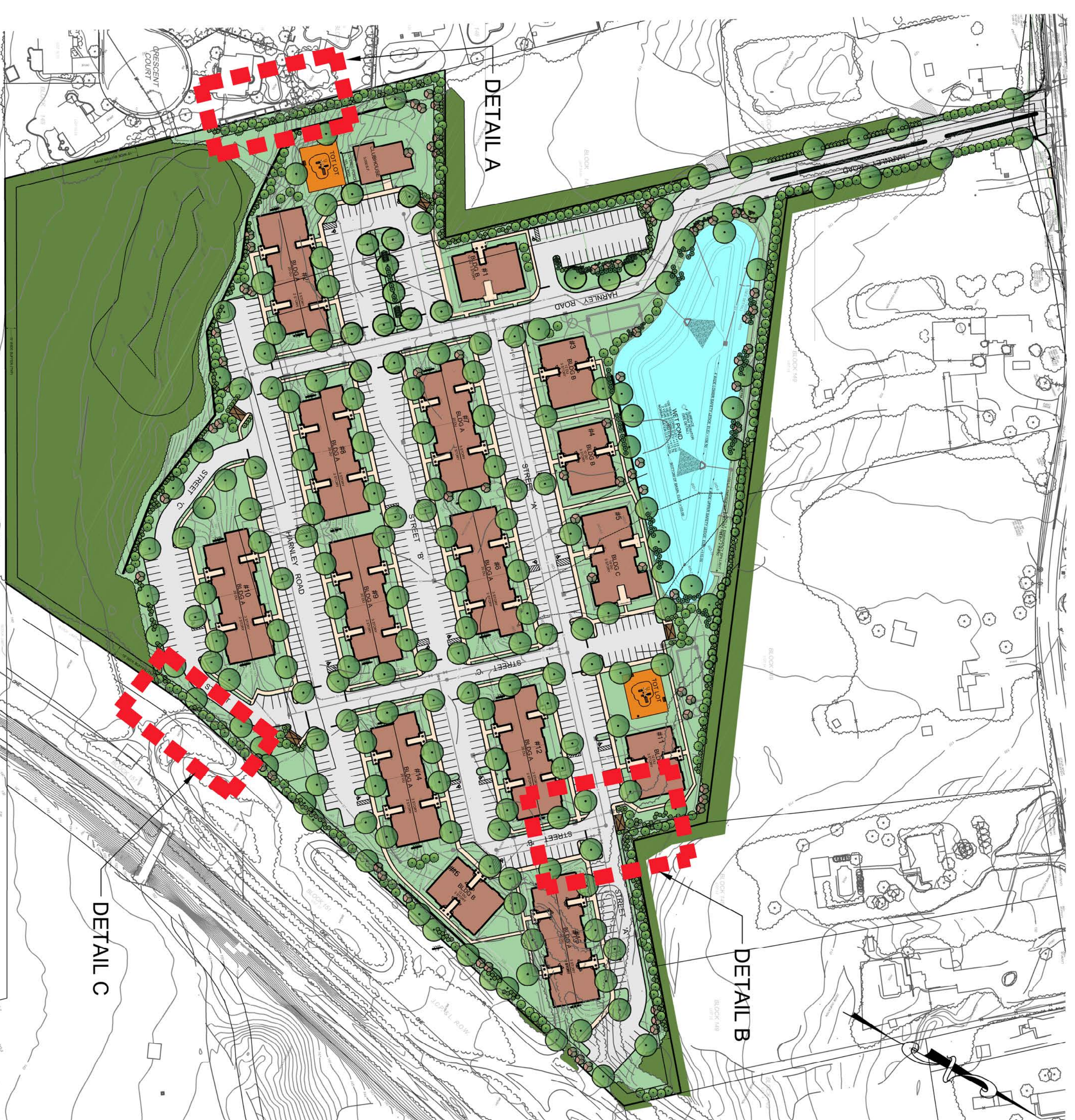
KEY MAP SCALE: 1" = 100'